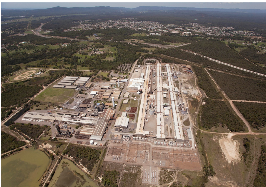
Figure 1 –Hydro Aluminium Smelter as viewed from the north

The Hydro Land is centrally located within the Hunter Region (refer to Figure 2 for location of landholding), with the majority of the site in the north eastern area of the Cessnock LGA, with the remainder located within Maitland LGA. Despite being a significant employee within the Hunter Region, the majority of the Hydro Land has remained zoned as rural land.